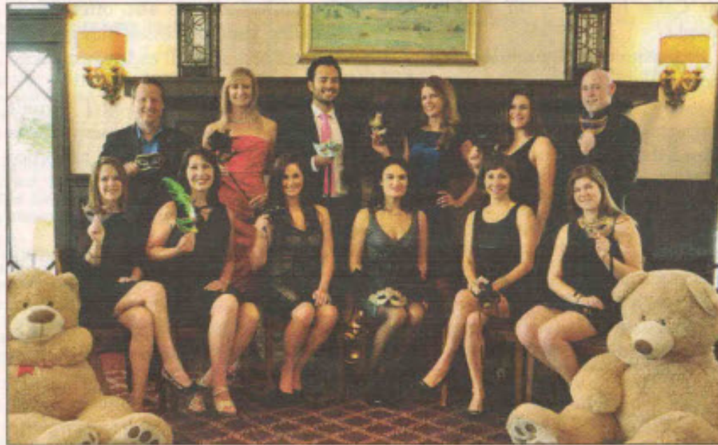
TBCF's Moments in Time committee members at the Santa Barbara Club, where "A Masked Affair" will be held May 2

Local nonprofit Teddy Bear Cancer Foundation (TBCF) has announced a new annual spring fundraiser to replace the wildly popular Saks & The City event, which, after seven successful and sold-out years, has been retired. The new event series, "Moments in Time", kicks off next week with a masquerade-themed fundraiser called "A Masked Affair".