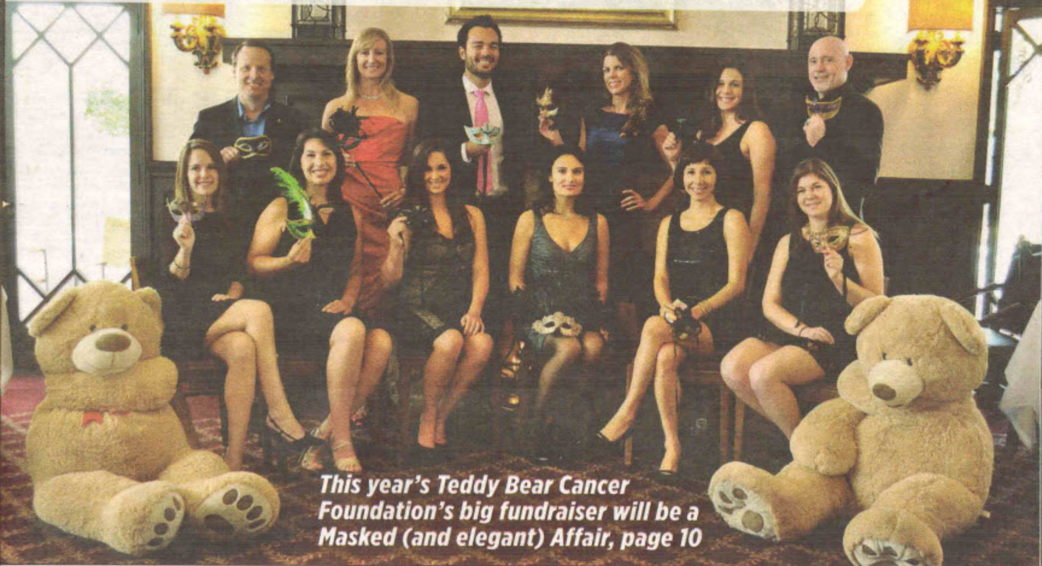
This year's Teddy Bear Cancer Foundation's big fundraiser will be a Masked (and elegant) Affair, page 10