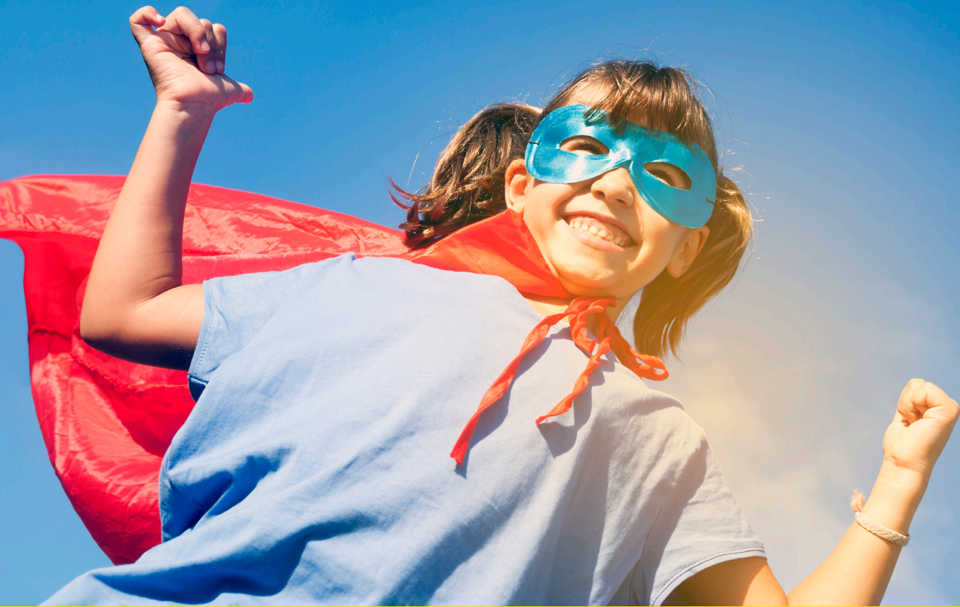
TABLE CAPTAIN PACKET