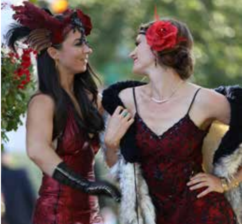
Event performers in Gatsby costumes.